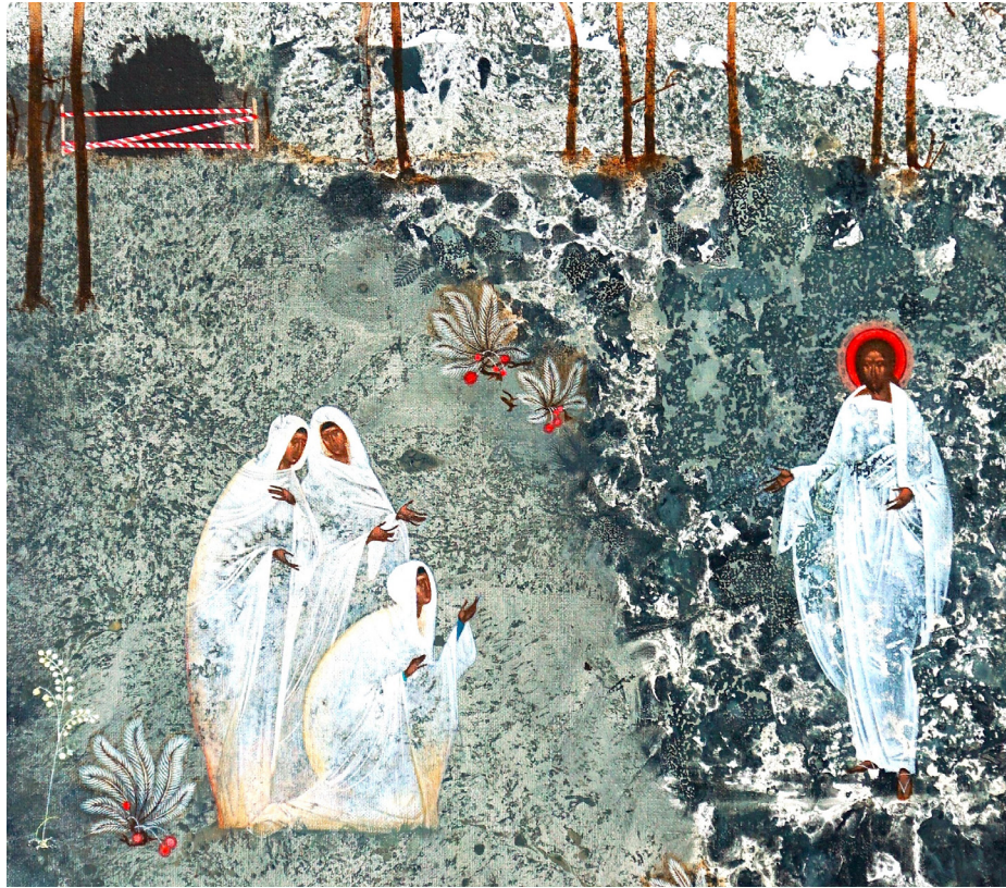
"Christ and the myrrhbearers"